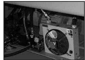
Two Stage Hydraulics with Air Cooler For Long Life