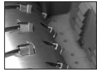
Large Diameter Rotor with "Swing Style" Ram with Serrated Front Surface