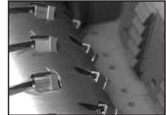
Large Diameter Rotor with "Swing Style" Ram with Serrated Front Surface