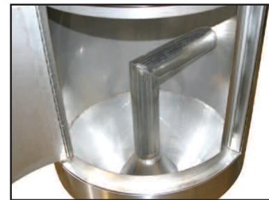
Hopper interior features stainless steel throughout