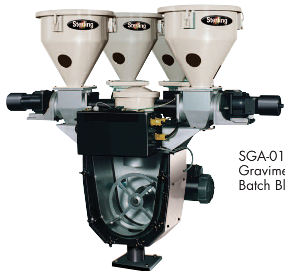
SGA-012 Gravimetric Batch Blender