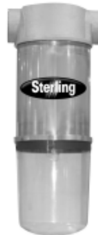
SFC-S Central Filter

Clean, filtered air goes to the vacuum pump