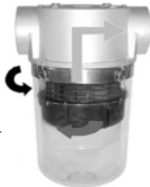
SFC-SC Cyclonic Pre-Filter

Cleaner air then proceeds to the primary pump central filter