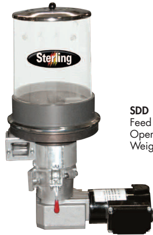
SDD 1 Feed Rate: 0.2-800 lbs/hr Operating Load: 0.2 kW Weight: 51lbs (23kg)