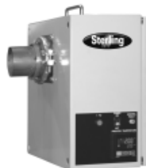
Optional floor mount model