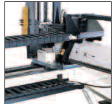
Rack and pinion gear on all 3 axes (models 1500 and higher)