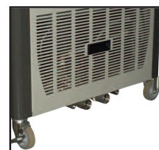
Locking swivel casters