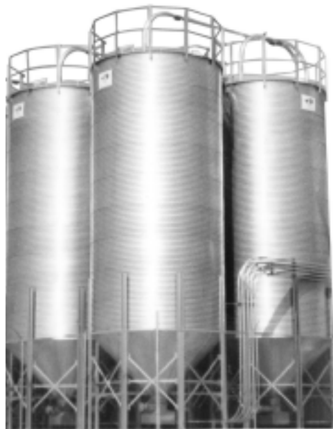
Bolted, Corrugated Silos

Sterling Silos are constructed from an FDA approved galvanized metal which provides a maintenance free surface. The silos are sealed with FDA approved crosslinked polyethylene foam sealant to prevent water infiltration. Various capacities, methods of fill and discharge are available. Accessories and safety equipment to OSHA specifications, are available to meet customer needs.