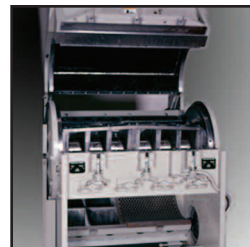
Easy access for maintenance and color changes